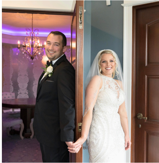
The secondary suite has a custom-made poker table & bathed in natural light.