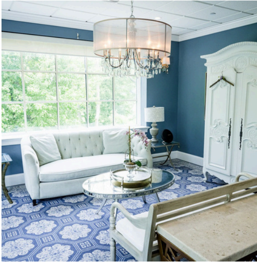
The main suite features a spacious vanity area, large mirror & picturesque windows.

Our upstairs private Suites & Game Room offer the perfect space to relax and prepare before your wedding. Each suite is filled with stunning natural light, creating a beautiful setting for photos. Enjoy a selection of fresh fruit, cheese, and crudité, along with a variety of beverages, such as coffee, champagne, wine, beer, and more, ensuring a comfortable and enjoyable pre-ceremony experience.