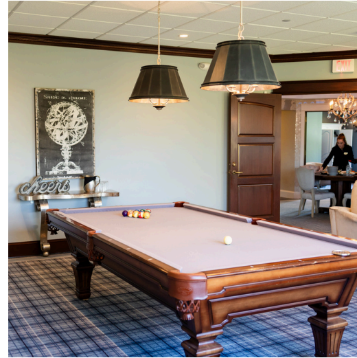
The Game Room Suite has a TV, pool table, shuffleboard, foosball & comfortable seating.