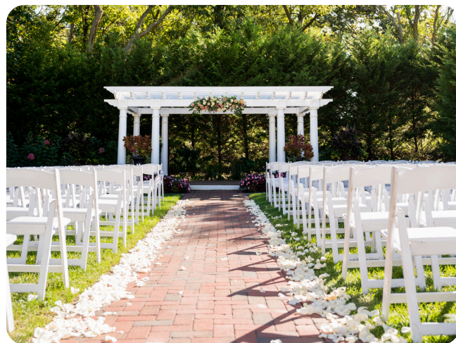
OUTDOOR CEREMONY SPACE