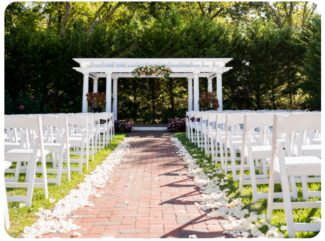
OUTDOOR CEREMONY SPACE